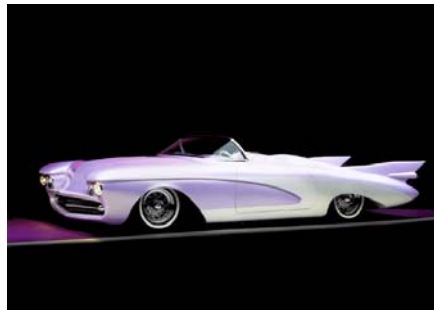
The 1959 "Cadster"