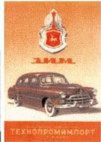
At left, 1952 ZIM, formerly used by Soviet Embassy in Washington. Above, brochure for the ZIM automobile. Below, 1948 series 6269 sedan at 2000 GN.

Many CLC members know the story of the Russian ZiS-110, which supposedly was made using the tooling and body dies from the 1942 Packard 180, shipped to the USSR as a gesture of Allied solidarity by FDR to Joseph Stalin during WWII. Later ZiS cars were made as close copies of other Packard models but without the original tooling and dies. It seems that Stalin, like Czar Nicholas before him, preferred Packards to Rolls, Mercedes or Delahayes.